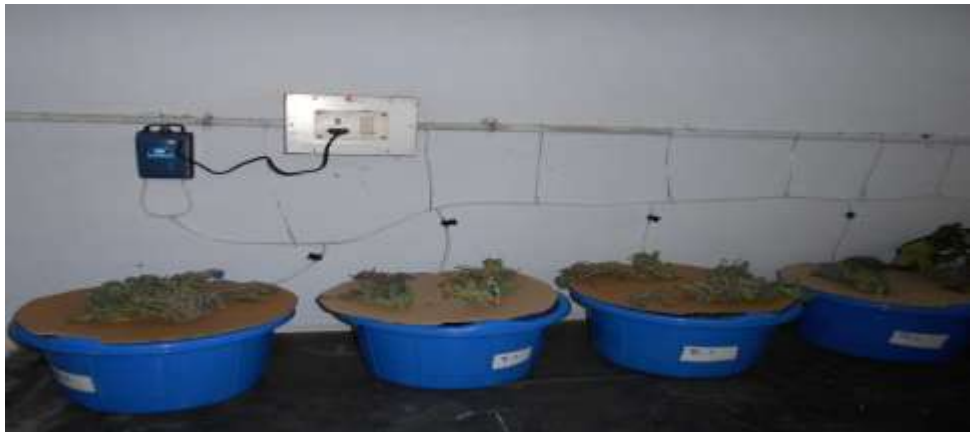
B. Heliotropium curassavicum L.