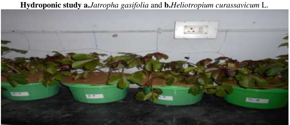
A .Jatropha gasifolia